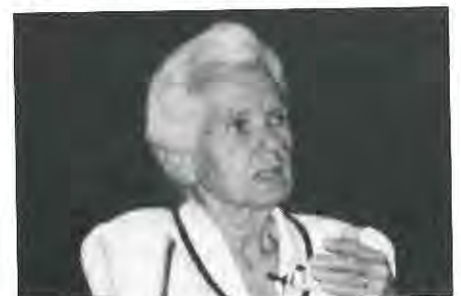
Viola Frymann, D.O., F.AAO

Other health care modalities represented included homeopathy, acupuncture, midwives, and naturopathy. All agreed that the comprehensive plan should include freedom of choice so that individuals are not forced to choose traditional medicine. There was an overall agreement, among the panel, that individuals must be informed somehow of the various modalities available so that they could make informed choices. Frymann was impressed with the members of the task force because they seemed to have put aside political motives and are truly attempting to form a better system of health care. □