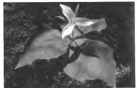
About the cover: Trillium —A genus of chiefly N. American herbs (family verticillium ) having short rootstocks and an erect stem bearing a whorl of 3 leaves at the summit with a corolla that is white, pink, purple, yellow or greenish. This ancient representative of the trilog has survived despite its simple structure.